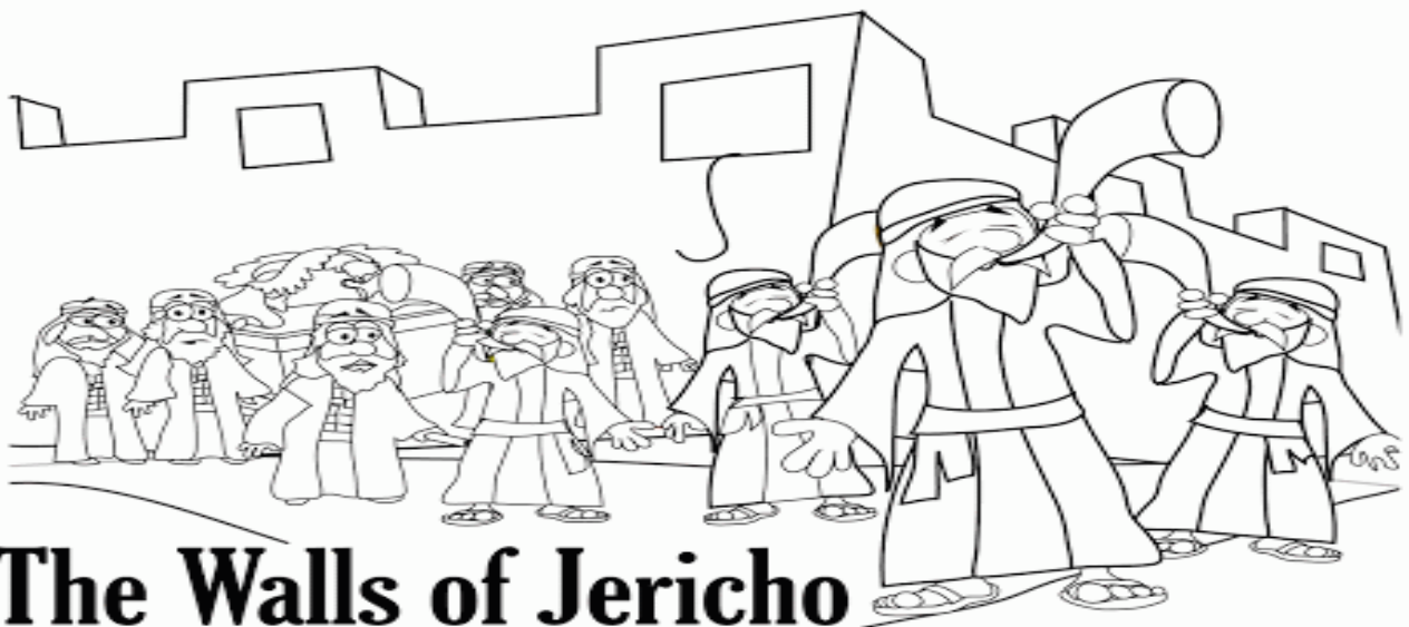
The Walls of Jericho